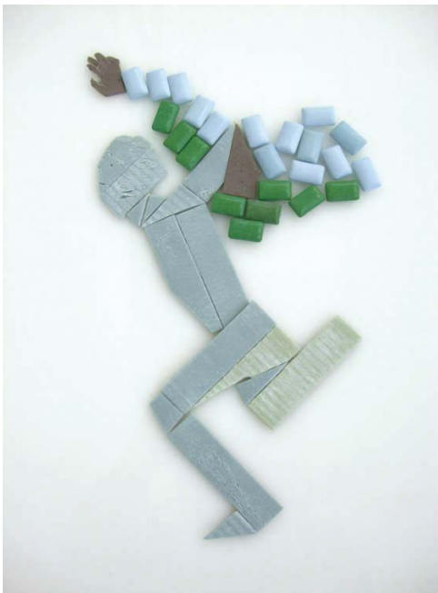
running coat 30×20cm, gum, cardboard, 2013