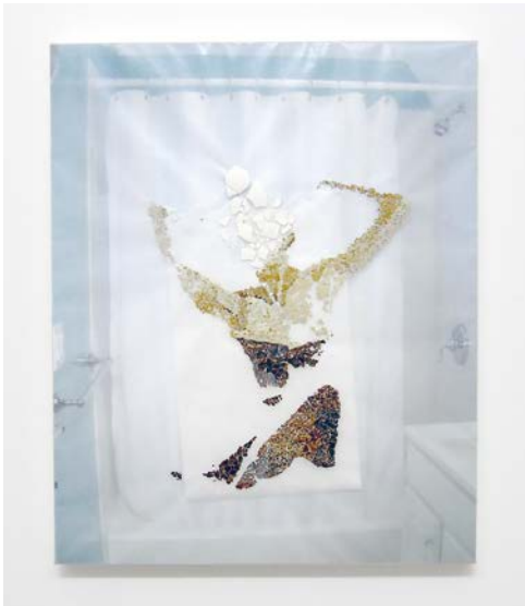
shampoo with woman 20.3×25cm, collage, quail egg, oil paper, 2012