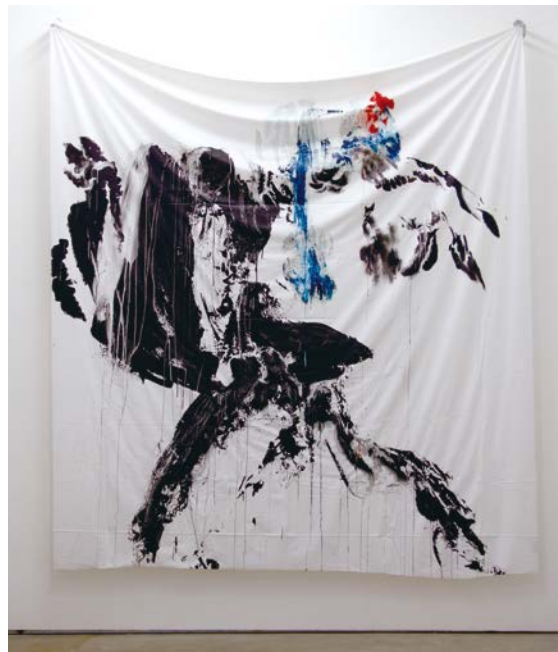
Chicken Man 180×180cm, acrylic on PVC tarpaulin, 2005