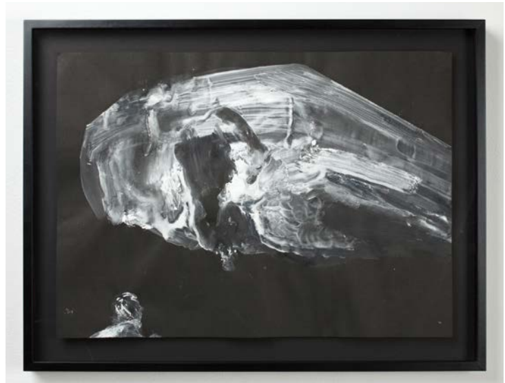
tupper 54×39cm, conte, calcium sulfite on black flock paper, 2011